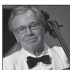
Arto Noras Finland