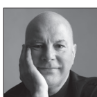
Elmar Oliveira U.S.A.